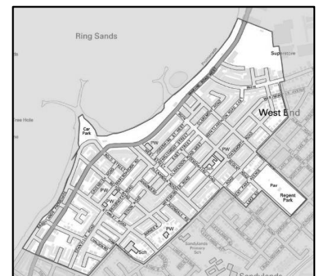
Picture: The WEM area, although activity and benefits ripple further out.

• WEM has had its ups and downs. It's succeeding with some things and made mistakes elsewhere, but this is in line with the Big Local approach which supports learning as things go along. In doing this the partnership has evolved. We now commission activity rather than do open grants.