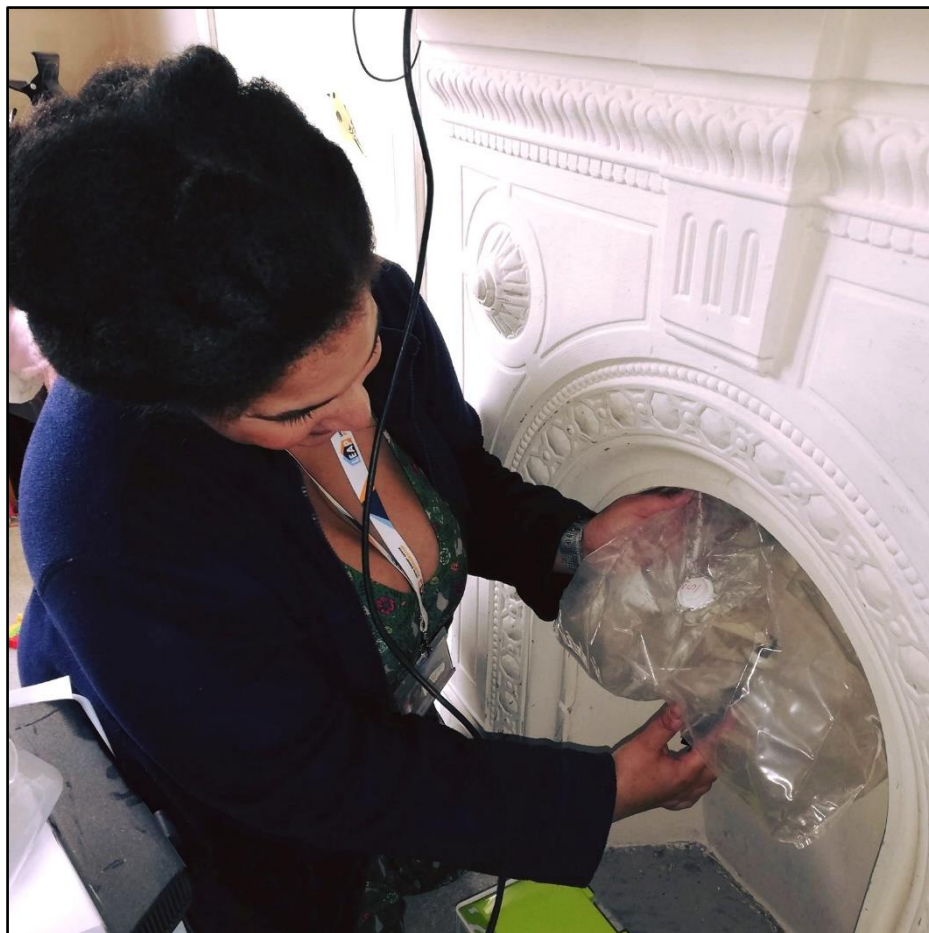
Picture: Fitting a heat saving 'chimney balloon'.