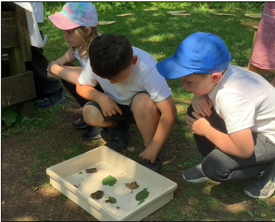
Picture: West End children studying nature.