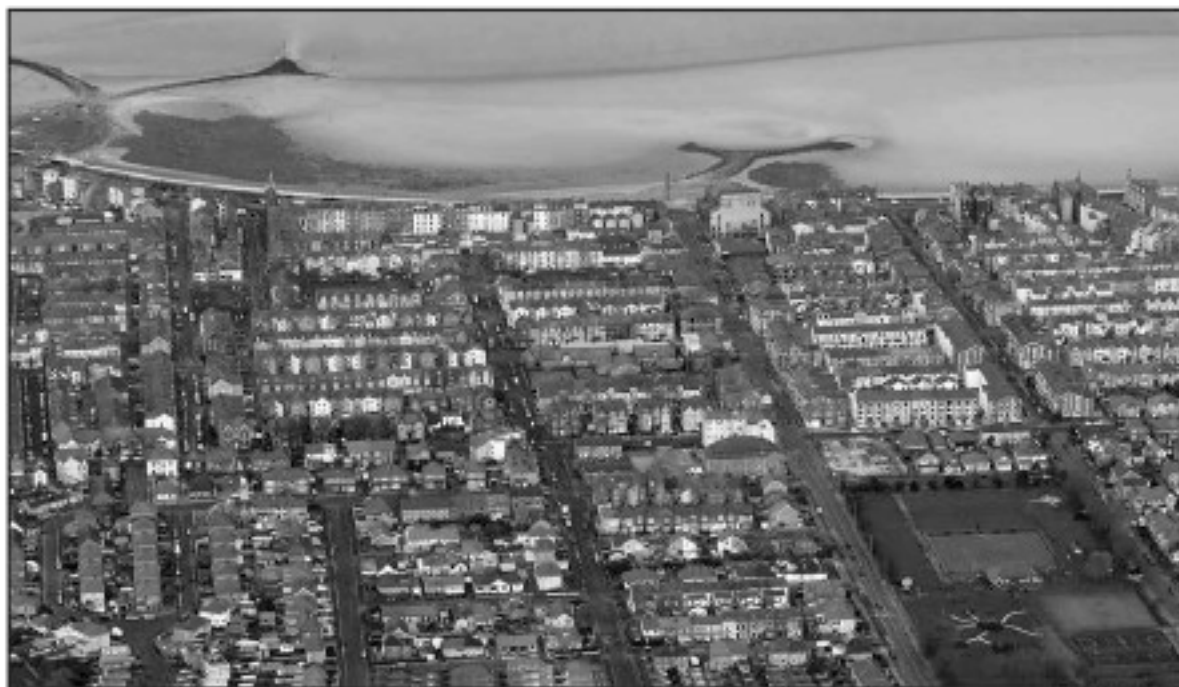
Above, A seagull's eye view of the West End

It's important to note that, though discussions are ongoing, no commitments have yet been made.