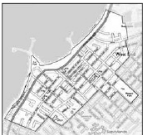
West End Morecambe, Big Local, has a focus in this area although activity may ripple further out.

Now in our fifth year WEM has had its ups and downs. It's succeeding with some things and made mistakes elsewhere but this is in line with the Big Local approach which supports learning as we go along. In the last year WEM has moved to a new process of commissioning activity.