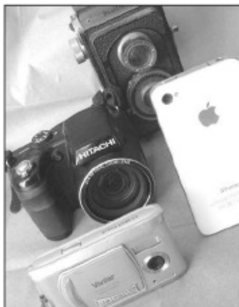
Which camera do you choose?

Can you find the words in the grid? Words can run forwards, backwards, vertically or diagonally but always in a straight unbroken line. Answers on page 2.