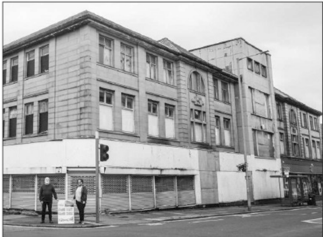
Centenary House Co-op building